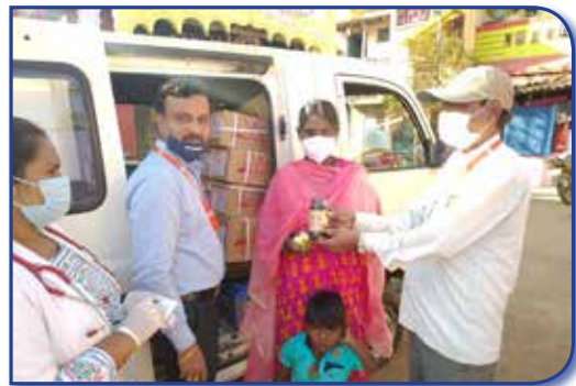
Medical Camp was organised by Dept. of Community Medicine at Ward No. 50 & 51 Kulkarni Hakkal, Ganesh Peth, Hubballi on 12-12-2020